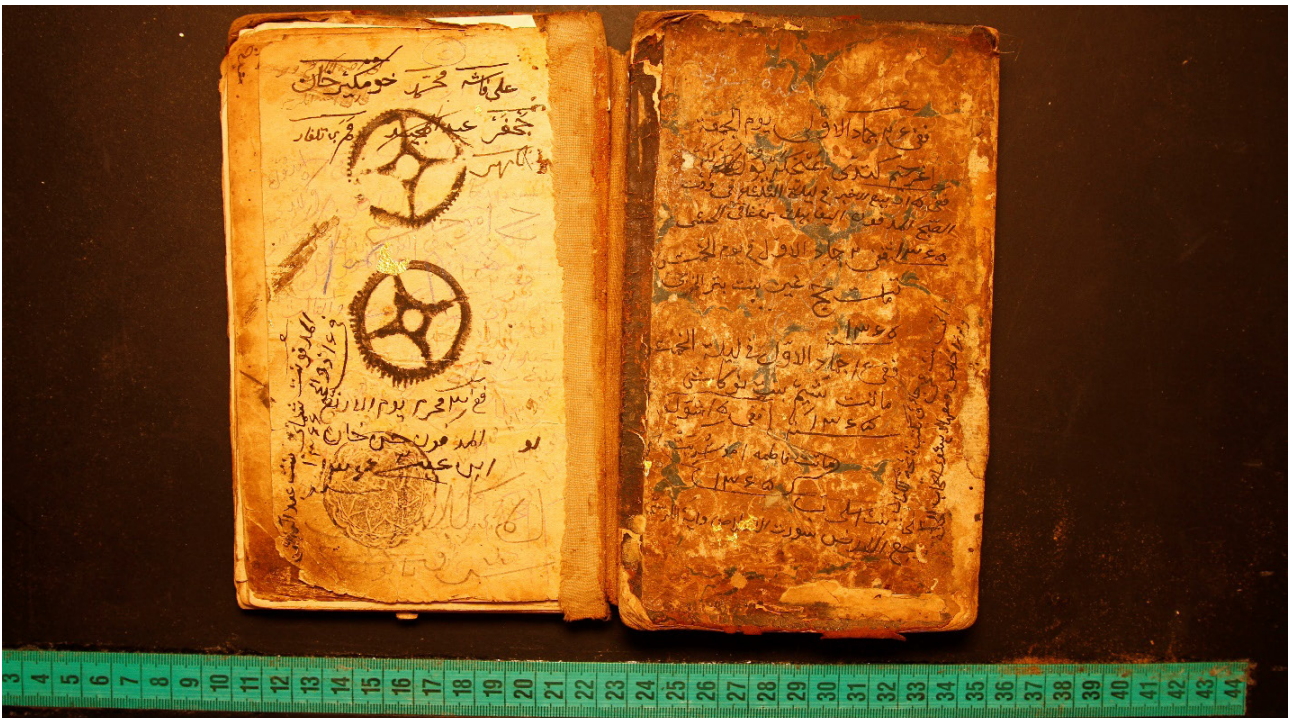
Fig. 2. Folio 1 from the composite manuscript from the collection of Sh. Magomedov