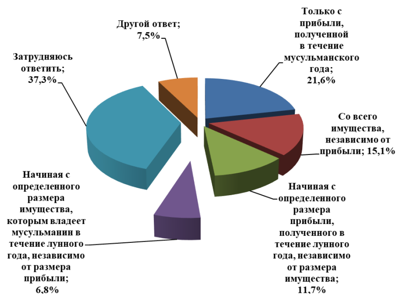
Chart 3 Distribution of answers to the question of what property, income, a Muslim must pay the annual zakat tax. RD. 2021.

Распределение ответов на вопрос: «Какие налоги в настоящее время Вы платите? (Можно выбрать несколько вариантов ответа)». РД. 2021.