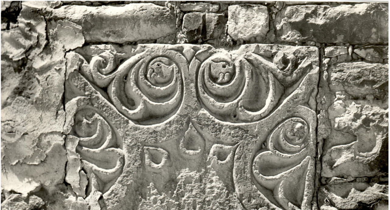
Fig. 7. An ornamented keystone inserted into the masonry of the northern longitudinal wall of the 15th century Great Mosque in the lower district of Kubachi. The image of the animal in the lower part of the relief is completely broken off

Рис. 7. Замковый камень с орнаментом, вставленный в кладку северной продольной стены Большой мечети XV в. в нижнем квартале сел. Кубачи. Изображение животного в нижней части рельефа полностью сбито