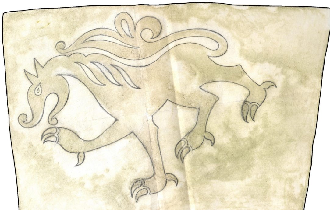
Fig. 12. A relief from Kubachi with a stylized image of a carnivorous animal of undetermined species. The 14th – early 15th century. The Gamzatova Dagestan Museum of Fine Arts

Рис. 11. Замковый камень ворот с изображениями двух вертикально стоящих друг против друга животных (центральная часть композиции сбита), обрамленные по верхнему и боковым краям растительным орнаментом. С. Кубачи. Первая половина XV в. Национальный музей Республики Дагестан