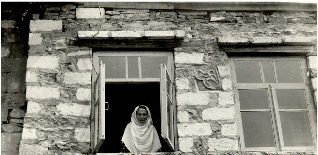
Fig. 4. A detail of a stone column of the tympanum with an image of a running man, girded with a dragon-serpent and feet in the form of clawed paws. Inserted between the windows of R. Khakachiev's house for decorative purposes. The 14–15th c.

Рис. 3. Рельеф с изображениями бегущих зайцев и с орнаментом в кладке стены одного из жилых домов в нижнем квартале с. Кубачи. XIV–XV вв.