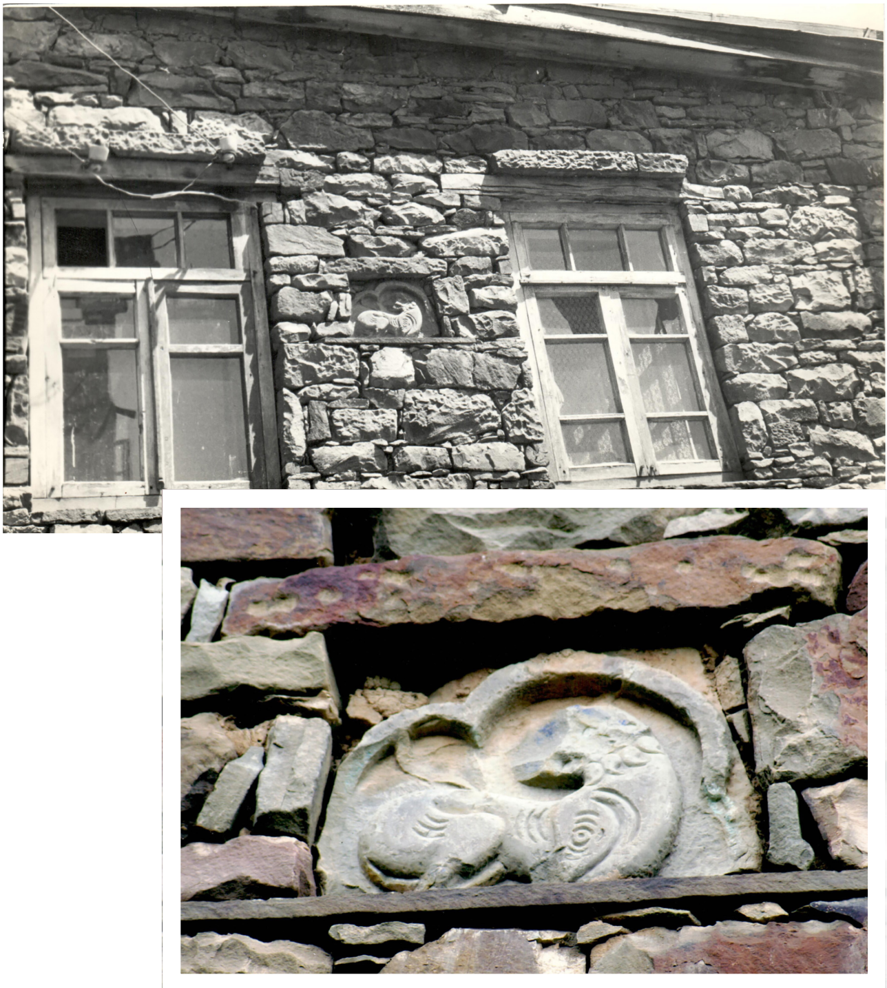
Fig. 2, A, B. A relief depicting a lying animal, located in the masonry of the wall between the windows of G.-I. Kvarizhov's house in the lower district of Kubachi. The 14–15th c.