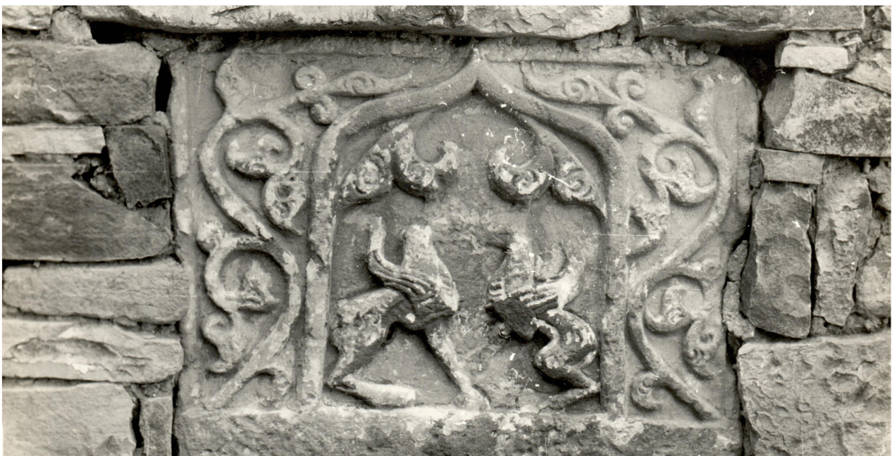
Fig. 8. A relief with images of crouched winged opposing animals (heads broken off) and with floral ornaments in the masonry of the wall of O. Shirpaev's house in the lower district of the village Kubachi. Second half of the 14th c.

Рис. 7. Замковый камень с орнаментом, вставленный в кладку северной продольной стены Большой мечети XV в. в нижнем квартале сел. Кубачи. Изображение животного в нижней части рельефа полностью сбито