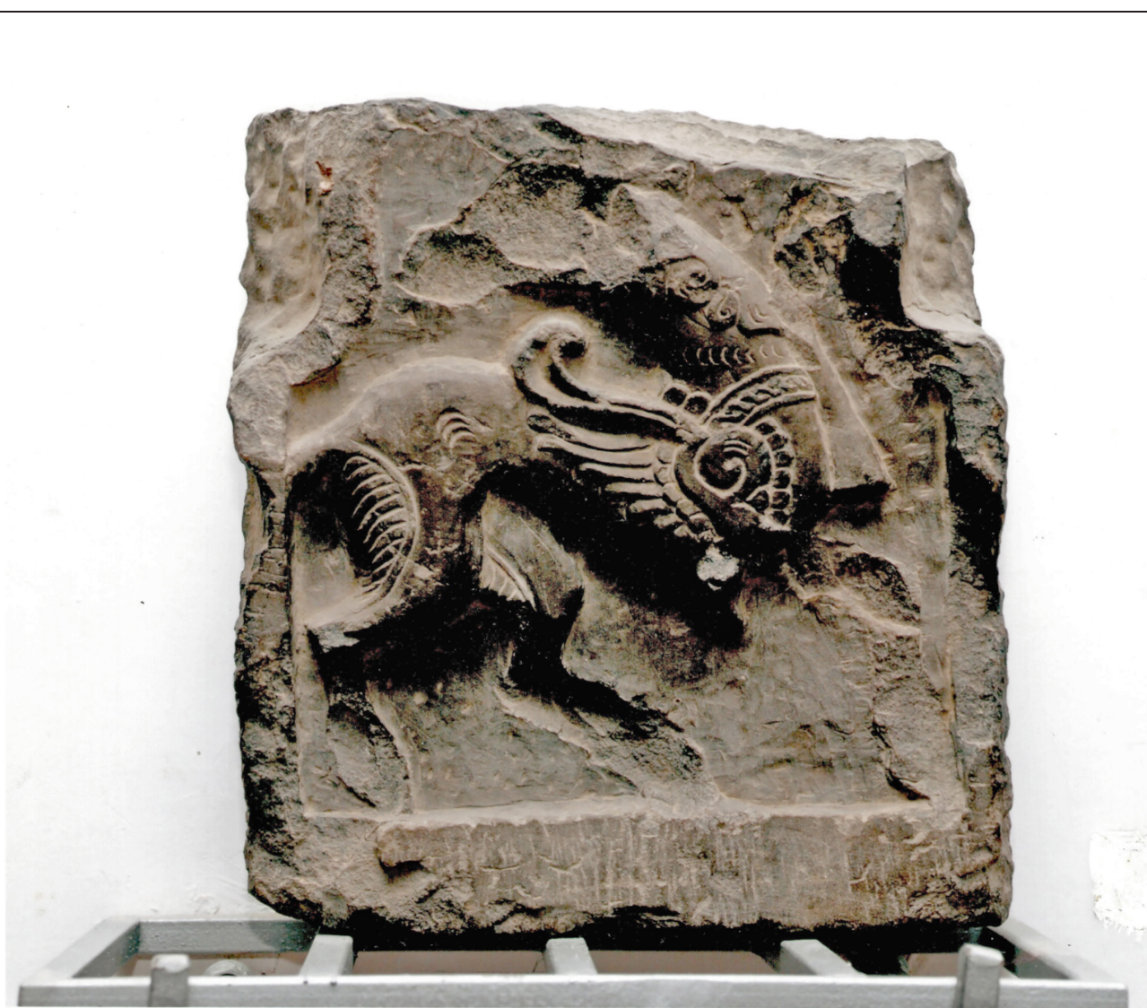
Fig. 13. A relief from Kubachi depicting a winged, decoratively finished animal with its head sharply turned back (broken off). The 14–15 c. The Gamzatova Dagestan Museum of Fine Arts

Рис. 13. Рельеф из с. Кубачи с изображением крылатого, декоративно отделанного животного с резко повернутой назад головой (сбита). XIV–XV вв. Дагестанский музей изобразительного искусства