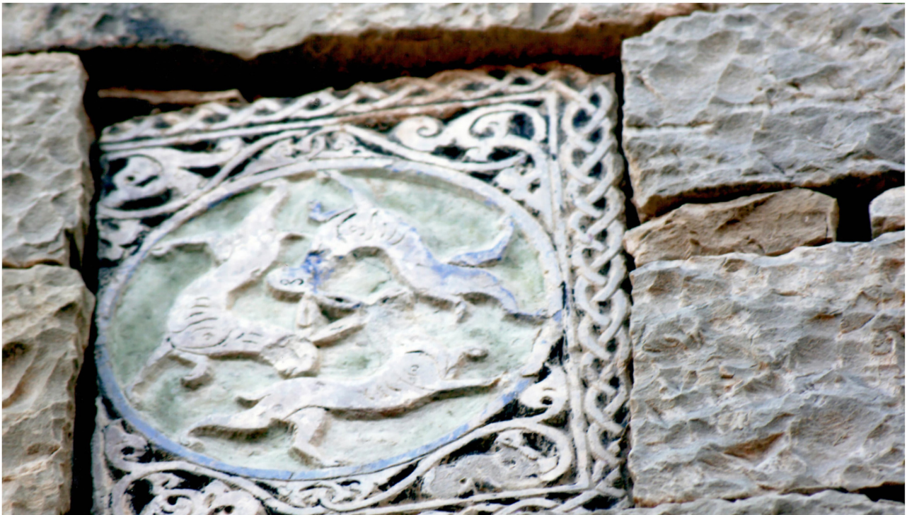
Fig. 3. A relief with images of running hares and with ornaments in the masonry wall of one of the residential buildings in the lower district of Kubachi. The 14–15th c.

Рис. 3. Рельеф с изображениями бегущих зайцев и с орнаментом в кладке стены одного из жилых домов в нижнем квартале с. Кубачи. XIV–XV вв.