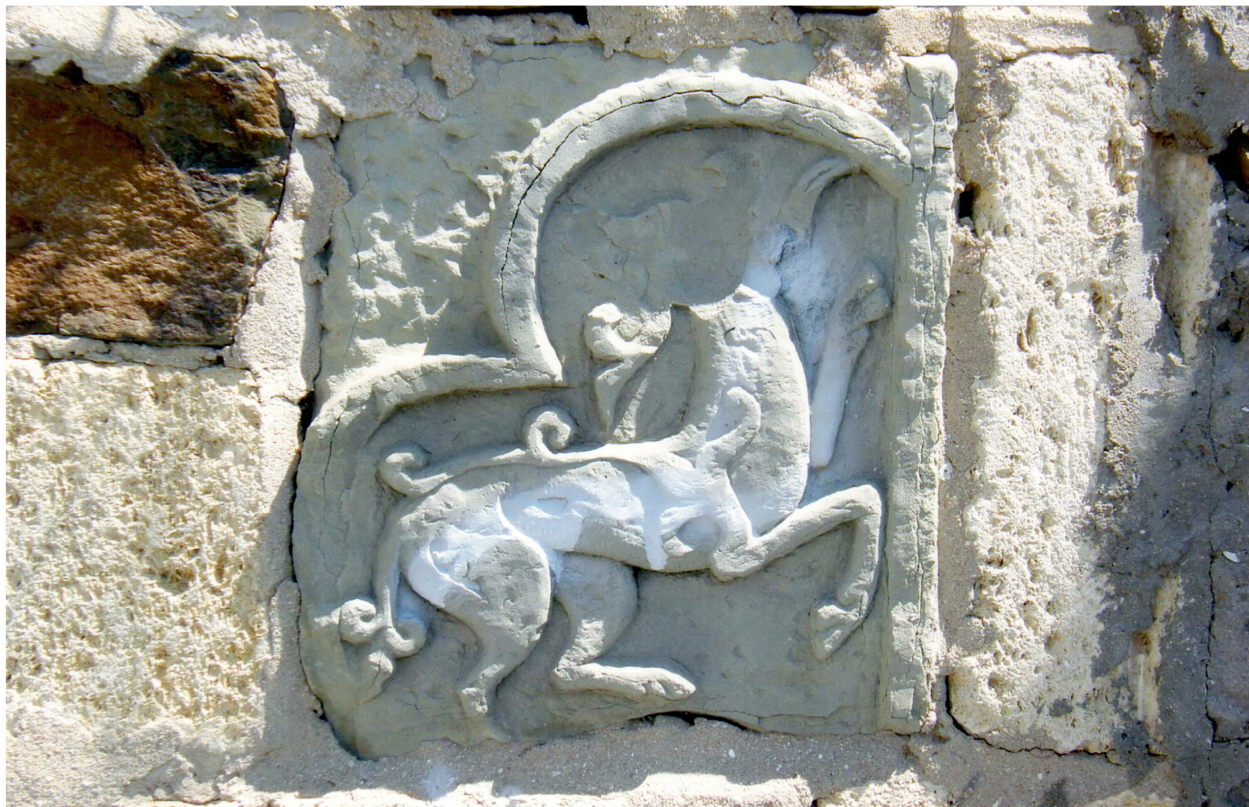
Fig. 5. An image of an animal with a broken off head in the masonry of the wall of R. Khakachiev's house in the lower district of Kubachi. The 14-15th c.