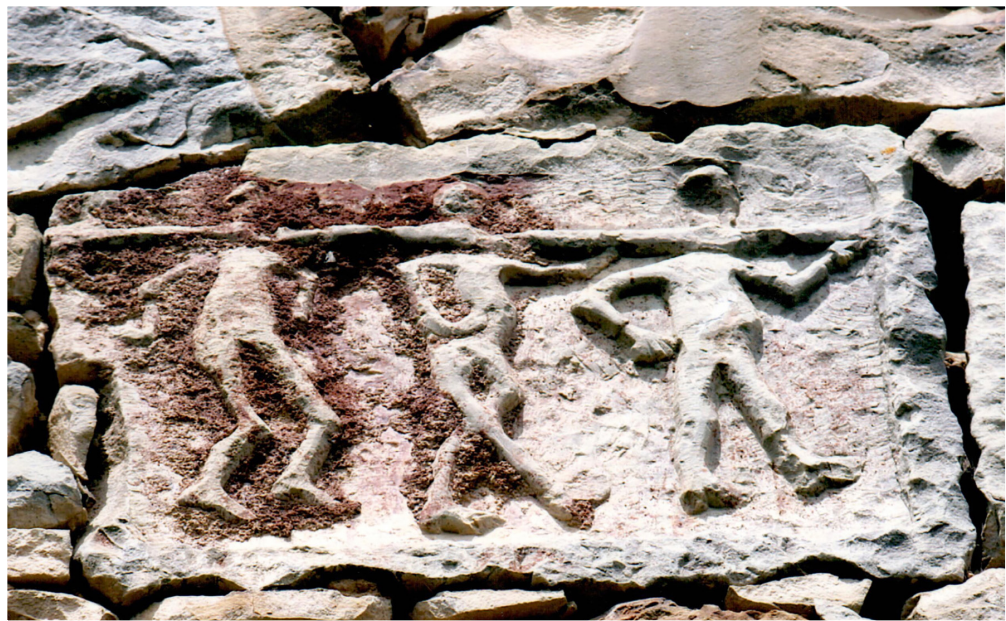
Fig. 1, A, B. A stone relief – an architectural detail depicting men carrying a long beam. The relief was installed during its reuse into the masonry of a partially preserved wall of a now collapsed residential building in the lower district of Kubachi. The 14–15th c.

Рис. 1, А, Б. Каменный рельеф – архитектурная деталь с изображениями мужчин, несущих длинную балку. Рельеф вставлен при его вторичном использовании в кладку частично сохранившейся стены ныне развалившегося жилого дома в нижнем квартале сел. Кубачи. XIV–XV вв.