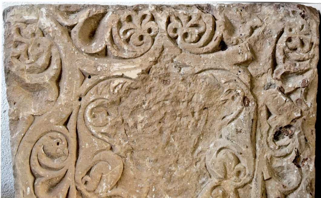
Fig. 11. A keystone of the gate with images of two animals standing vertically against each other (the central part of the composition is broken off), framed along the upper and lateral edges with floral ornament. Kubachi. First half of the 15th century. The National Museum of the Republic of Dagestan

Рис. 11. Замковый камень ворот с изображениями двух вертикально стоящих друг против друга животных (центральная часть композиции сбита), обрамленные по верхнему и боковым краям растительным орнаментом. С. Кубачи. Первая половина XV в. Национальный музей Республики Дагестан