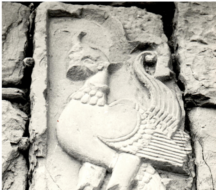
Fig. 9. A relief depicting a siren (?) embedded above the entrance of the former Jewelry artel “Khudozhnik” (now the House of Culture) on the boundary of the upper and middle districts of Kubachi. The relief has not remained in place. The 14–15th c.