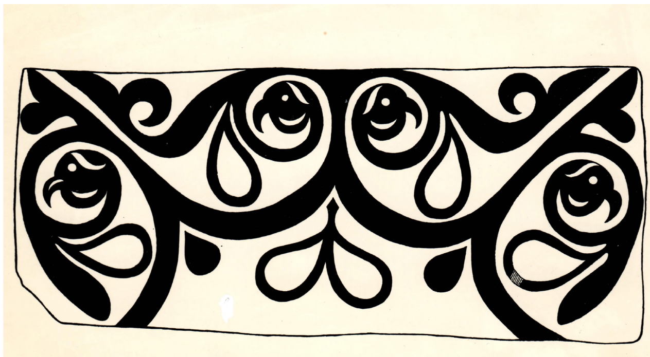
Fig. 6. The upper part of the keystone with floral ornaments and images of stylized bird heads. The relief is inserted into the stone staircase of M. Khakachiev's house in the lower district of Kubachi. Early 15th century. The location of the lower part of the relief is unknown