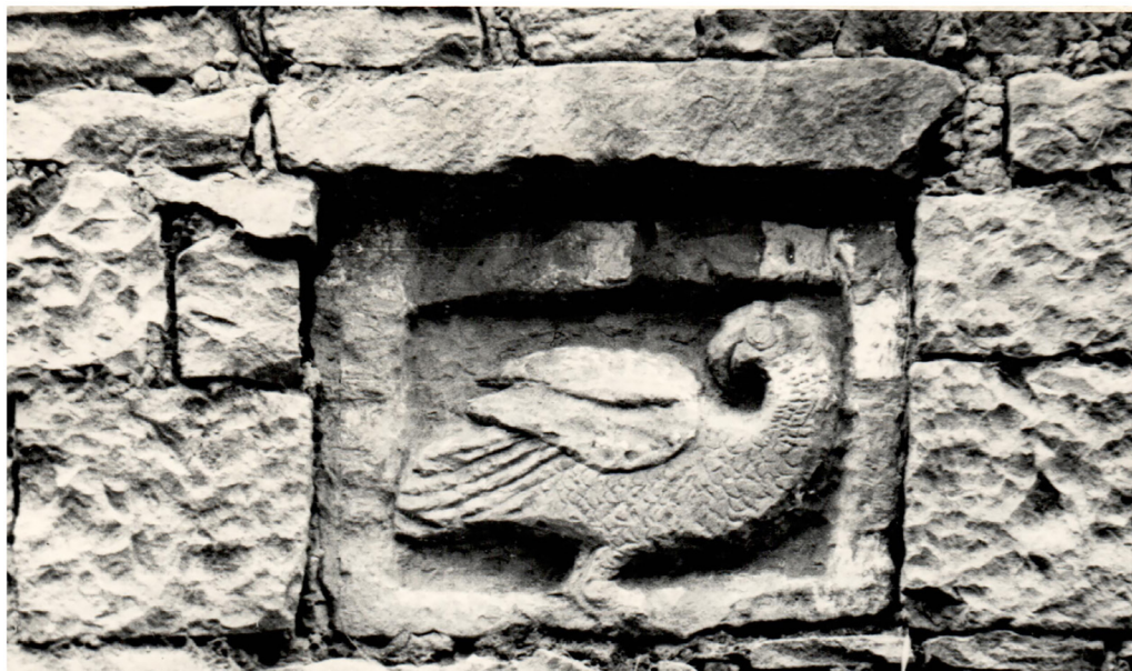
Fig. 10. A relief depicting a crouching bird in the masonry of the northern wall of the utility room of I. Gadzhiakhmedov’s house in the middle district of Kubachi. The 14–15th c.